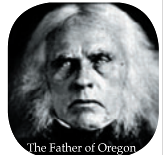
The Father of Oregon

was legendary among the American settlers. Ironically, by aiding settlement McLoughlin eroded the British Fort's command of the region, and in 1846 the governments of the US and Great Britain agreed that the national boundary would not be the Columbia River as the Brits had hoped, but instead the 49 th parallel to the north. The new border left Fort Vancouver in US territory, and by 1860 the HBC abandoned their once great outpost, relocating to Victoria, BC.