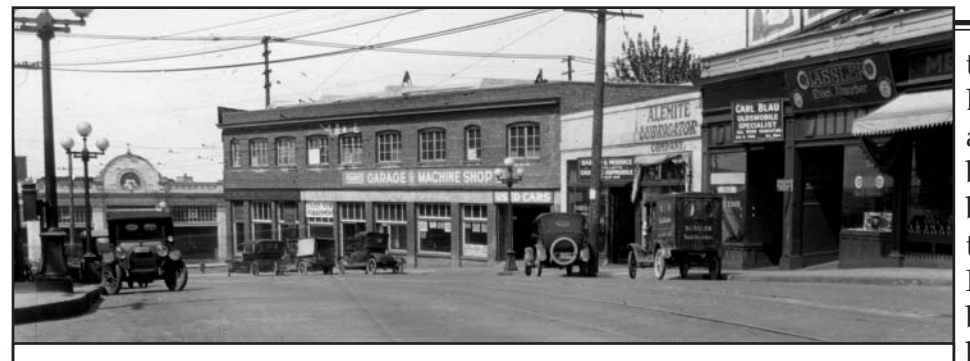
A look west down E. Pike St. from Minor Ave. in 1921 affords a clear view of the Six Arms' building.

business did not retain its grip with the public, and by 1925 the company had been absorbed by another and closed its Pike Street store. Shortly after, Peerless Motor Car moved in to the Six Arms space.